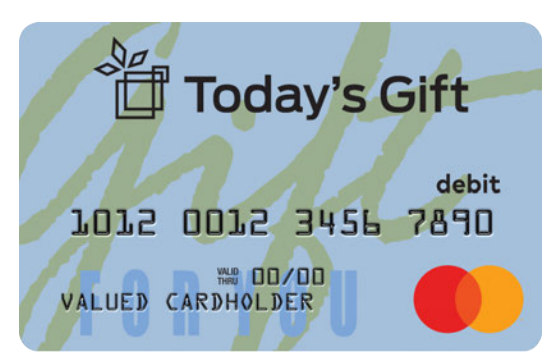
Gift Card Gift for You